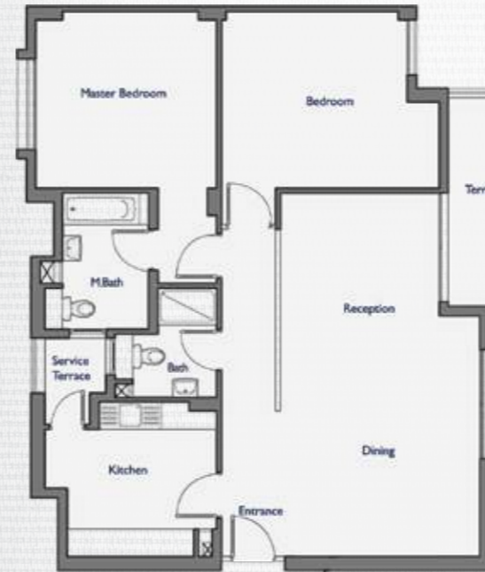
FIRST LEVEL - THIRD FLOOR PLAN